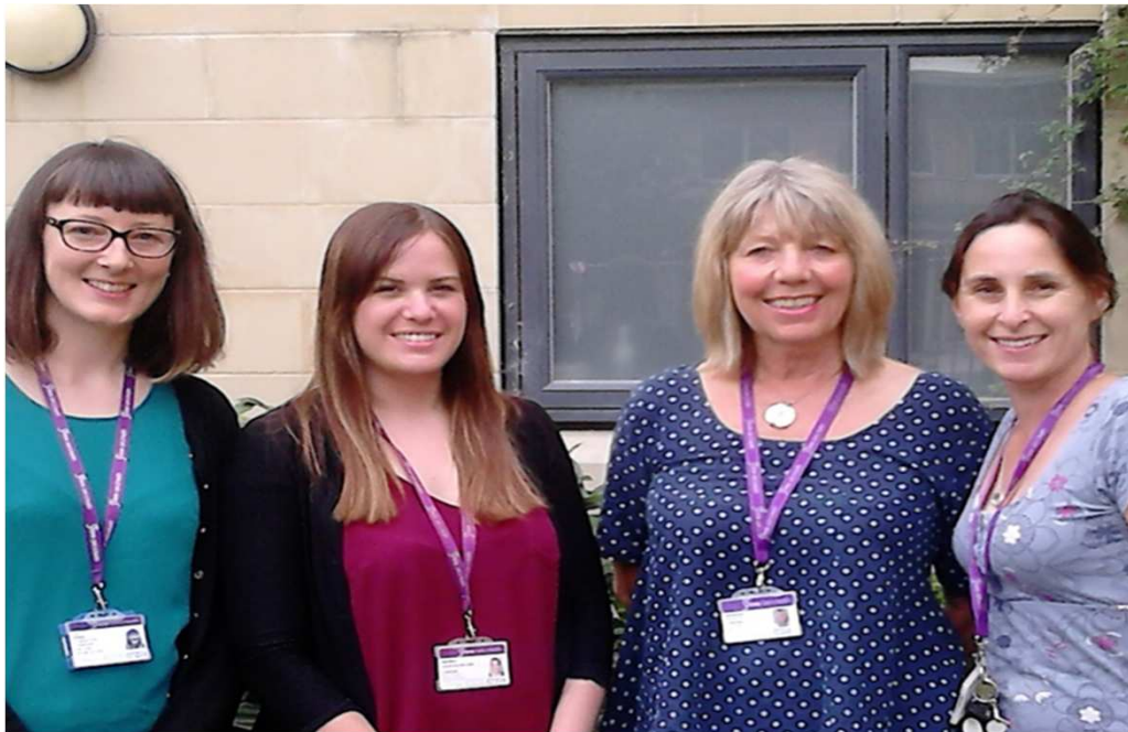
Picture: Sirona Care & Health's Community Learning Disabilities Nurses